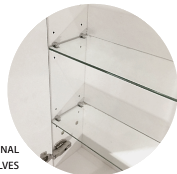
INTERNAL GLASS SHELVES