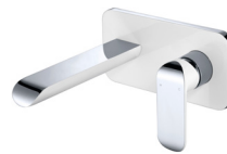
Chrome & White HYB11-601CW