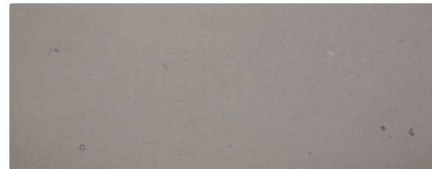
1200 mm slab shown