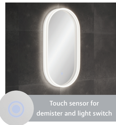
Touch sensor for demister and light switch